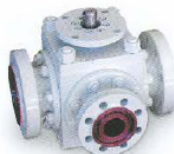
Three way ball valve