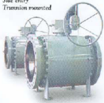
Side entry Trunnion mounted